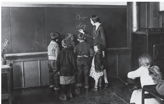
Figure 1. Children gather around a teacher as she writes different animal names on the blackboard. 1930. Source: https://www.yahoo.com/lifestyle/1930-today-heres-school-looked-040000544.html

Figure 1 shows a photograph found on a Yahoo Lifestyle website in a collection of photographs entitled «From 1930 to today, here's what school looked like the year you were born». 44 The caption beneath the photograph reads: «Children gather around a teacher as she writes different animal names on the blackboard. 1930». We uploaded the photograph to Google Images to trace its origins. The search generated a list of websites, many affiliated with Yahoo on Pinterest, but the photograph also appeared in several journals. On an Argentinian website, 45 the image was used to illustrate an article entitled: «Lo que no va más. ¿De dónde viene el uso de la palabra “señorita” para referirse a las maestras?» (The way things were. Where does the use of the word ‘Miss’ come from when referring to teachers?) The picture was also featured as an illustration in an article about the UK’s National Union of Women Teachers, 46 as well as in The New Yorker article «The Comma Queen. To Whom it may concern». 47 The latter included a caption with the text: «Does civilization depend on the proper use of “who” and “whom”? Photo-illustration by The New Yorker; Source: FPG/ Hulton Archive/ Getty». This allowed us to trace