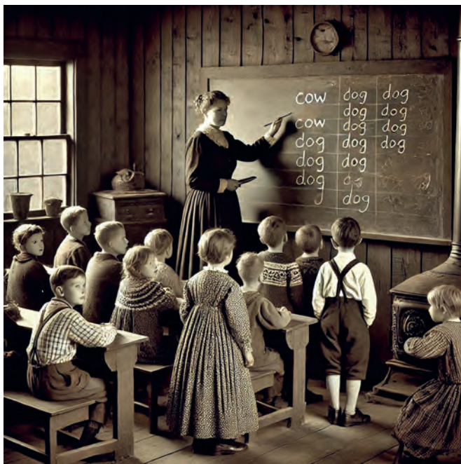
Figure 3. Image generated by DALL·E 3 using the prompt written by ChatGPT

Figure 3 was generated using the same program as Figure 2 (i.e. DALL·E 3). Further examination reveals the image more closely resembles the original photograph in Figure 1, with one clear exception. The AI controlling the image creator has decided to include school desks in the classroom. Although school furniture is not mentioned in the prompt, DALL·E 3 seems to associate classrooms with school desks. As a result, it added school desks to the image, arranged in the traditional manner—facing the blackboard—and emphasizing a teacher-centred classroom layout.