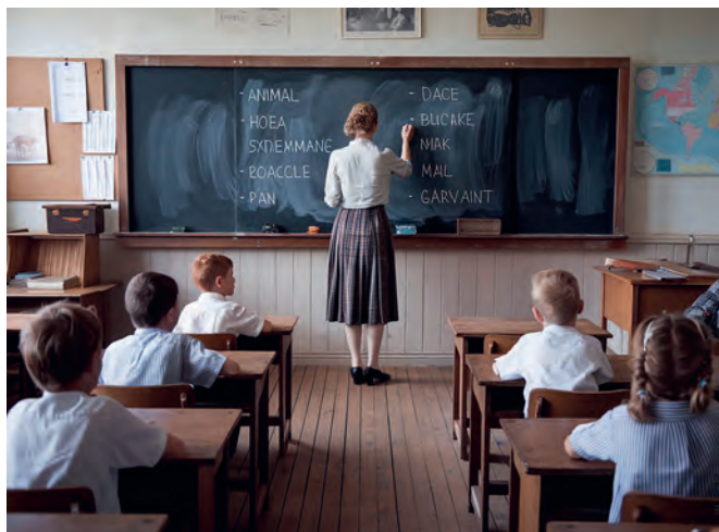
Figure 4. Image generated by Ideogram 2.0 using the caption of figure 1 as a prompt.

creator defaults to a teacher-centred approach when associating teachers with children. Additionally, mentioning the word «blackboard» in the caption leads the program to automatically place the scene in a classroom, reinforcing the conventional setting where teachers and children are typically imagined.