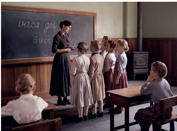
Figure 5. Image generated by Ideogram 2.0 using the prompt written by ChatGPT (translating the words cow and dog in Catalan and swapping the face of the teacher with the face of Maestra Justa Freire with SeaArt).